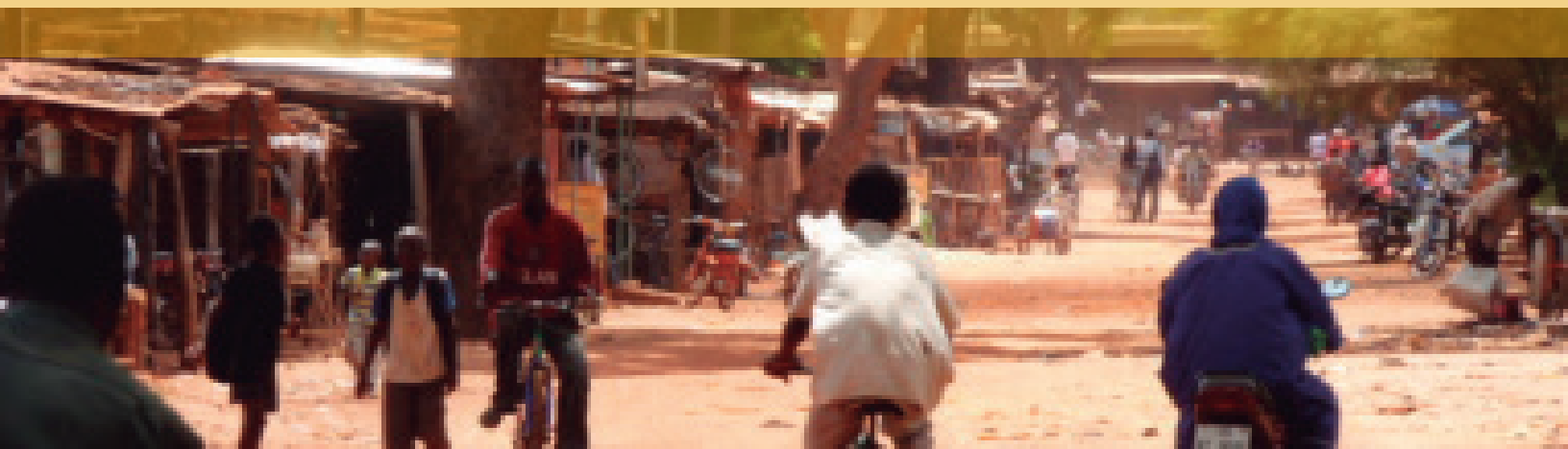
Commercial road in Tenkodogo, Burkina Faso.