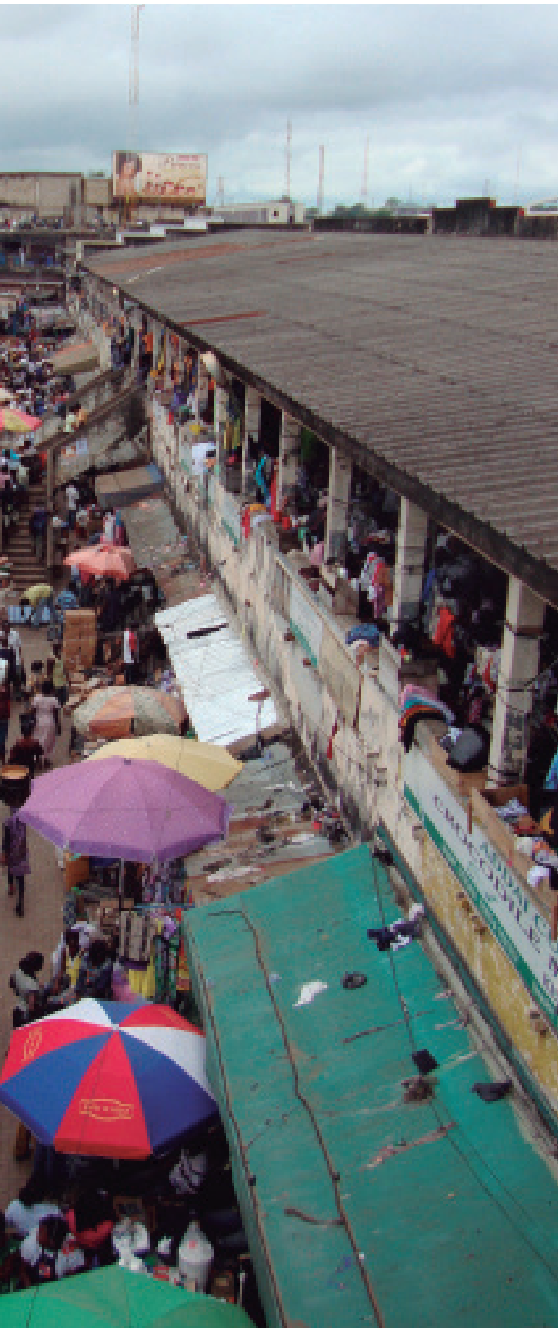
Central Market in Kumasi, Ghana.

expenditure on fixing and maintaining essential urban infrastructure can add 2% to the GDP of economies 12 while improving information, logistics, and governance systems can add significantly to improving the productivity and livelihoods of people living in cities. However, the efficiency of urban systems relies on the quantity, quality, level of use, availability of resources, and the governance systems used to plan, develop, operate, and maintain them. Investment in human capital development is the most necessary to improve the integration and flows in urban systems in secondary cities.