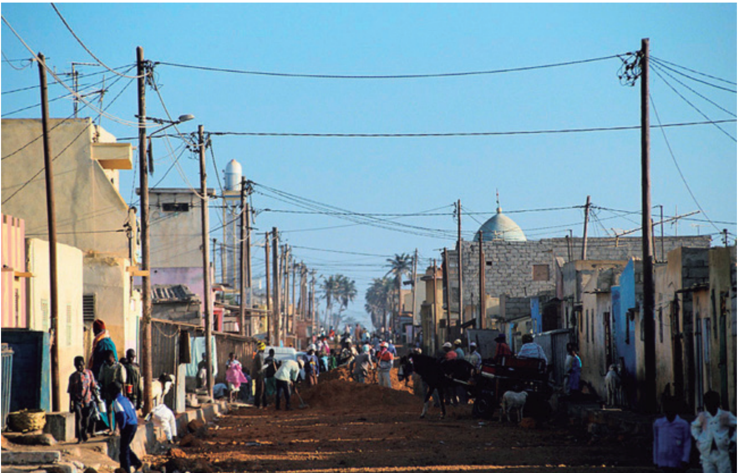
Strategic infrastructure investments in secondary cities need to be linked to Local Economic Development.

There are significant differences and some similarities in the way countries approach the development of secondary cities. The following important lessons and observations are drawn from a Global Study commissioned by the Cities Alliance on Systems of Secondary Cities in five regions and 16 countries.