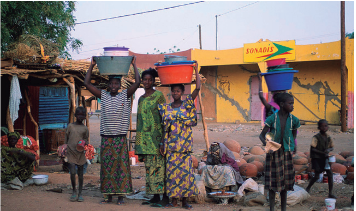
Most secondary cities are struggling to raise capital and attract investments for basic infrastructure.